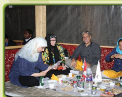
Imam Reza's Shrine

Participants can relax in Mashhad's countryside and experience its traditional culture. Our city and its surroundings also have many religious, ancient and historical sites that participants can tour. Amazingly, Mashhad hosts over 6 million tourists annually.