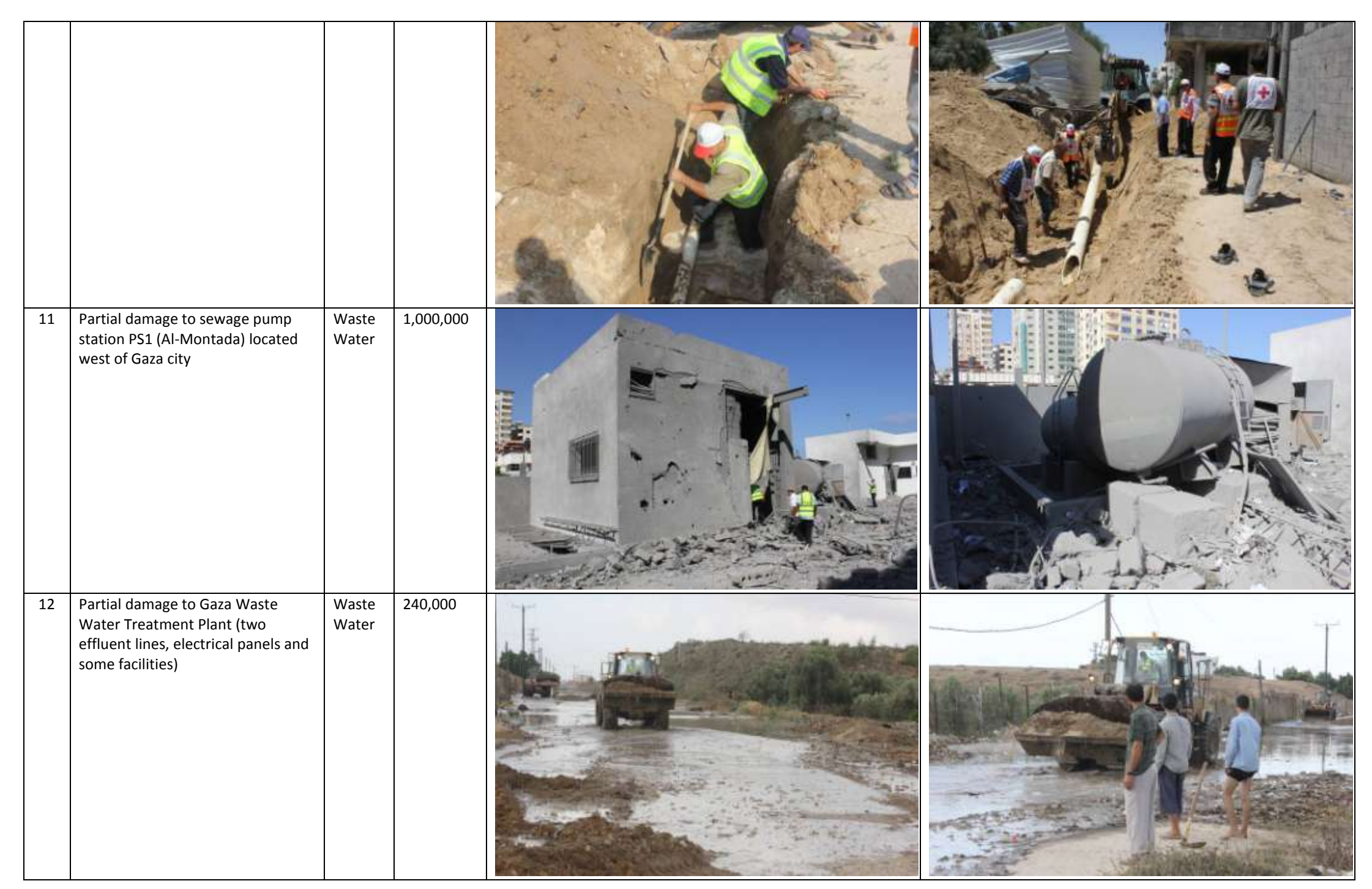
Page 5 of 11