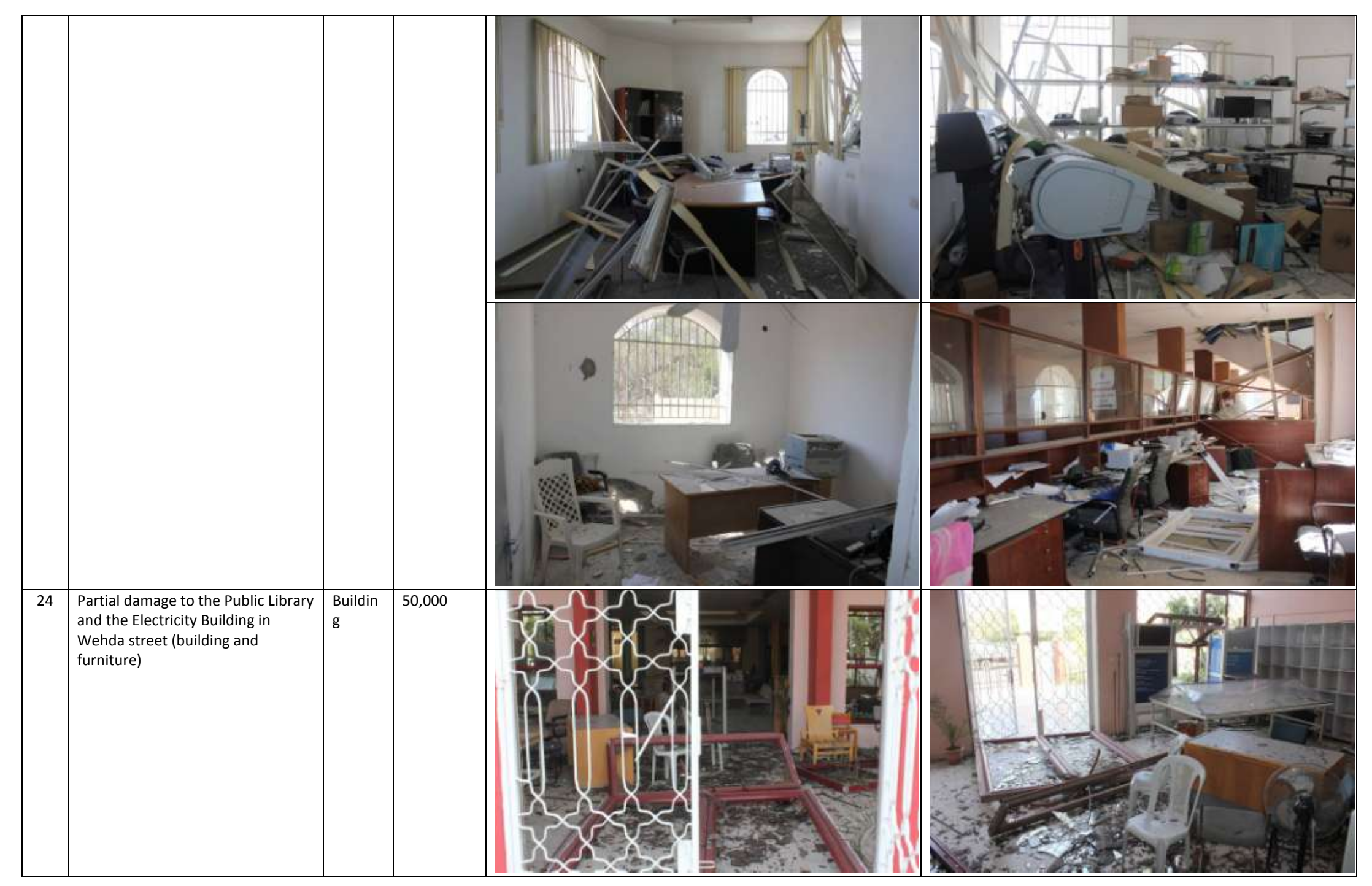
Page 10 of 11